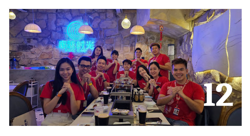
PLANNING COMMITTEE DINNER