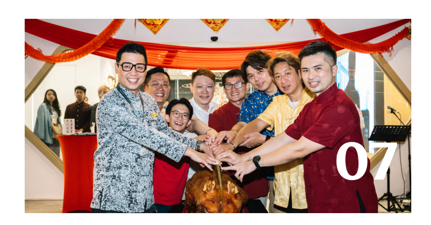
STARK SUPER HAIRSTORIAN & YES NIGHT