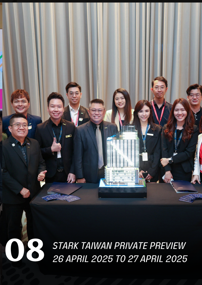
08 STARK TAIWAN PRIVATE PREVIEW 26 APRIL 2025 TO 27 APRIL 2025