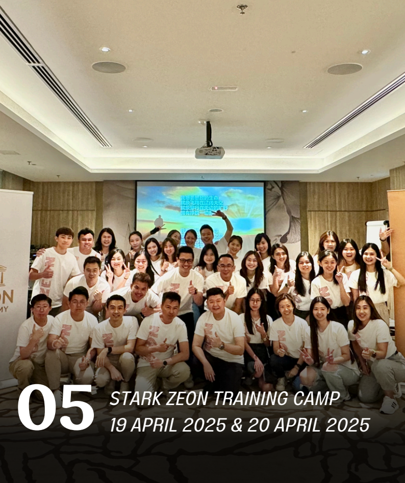
05 STARK ZEON TRAINING CAMP 19 APRIL 2025 & 20 APRIL 2025