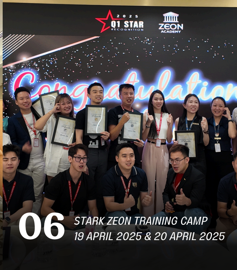
06 STARK ZEON TRAINING CAMP 19 APRIL 2025 & 20 APRIL 2025