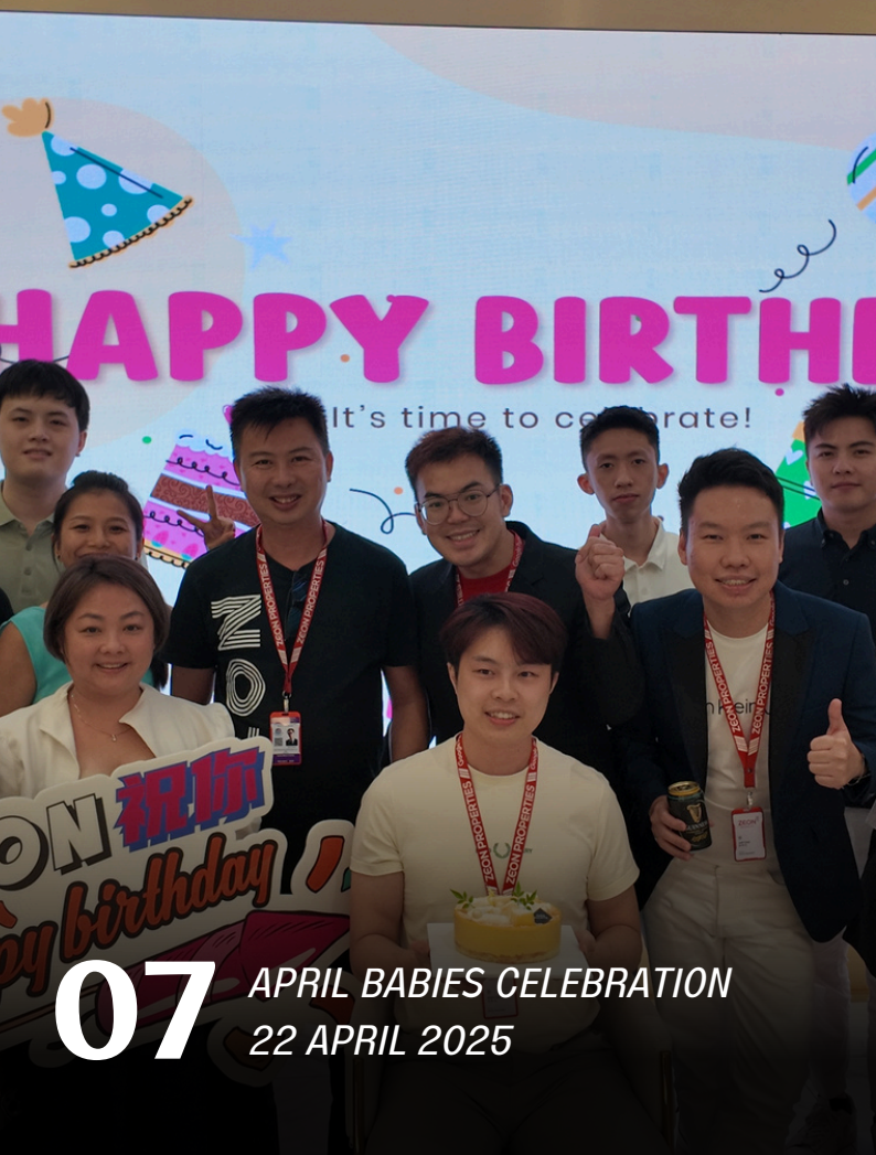
07 APRIL BABIES CELEBRATION 22 APRIL 2025